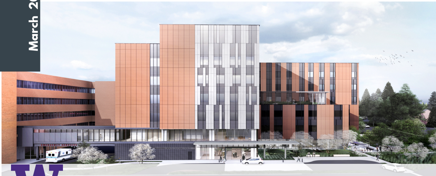
Rendering of BHTF, SRG Partnership

The purpose of this bulletin is to inform staff, patients, visitors and the neighbors close to the University of Washington Medical Center Northwest campus about the Center for Behavioral Health and Learning construction project. This bulletin will be published quarterly during the design phase and monthly during the construction phase. Please see the webpage for more information about the project, construction logistics and the milestone schedule. https://facilities.uw.edu/projects/behavioral-health-teaching-facility