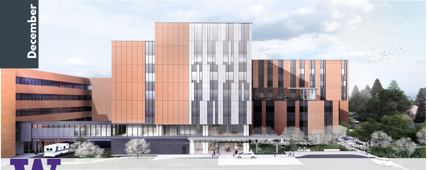
Rendering of BHTF, SRG Partnership

The purpose of this bulletin is to inform staff, patients, visitors and the neighbors close to the University of Washington Medical Center Northwest campus about the Center for Behavioral Health and Learning construction project. This bulletin will be published quarterly during the design phase and monthly during the construction phase. Please see the webpage for more information about the project, construction logistics and the milestone schedule. https://facilities.uw.edu/projects/behavioral-health-teaching-facility